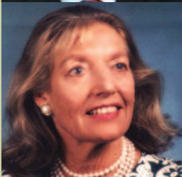
HAZEL HENDERSON Ethical Markets Author, futurist and syndicated columnist