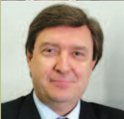
ENRICO GIOVANNINI President, Italian National Statistics Institute (Istituto nazionale di statistica - ISTAT)