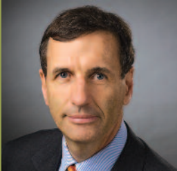
SCOTT VAUGHAN Canada's Commissioner of the Environment and Sustainable Development